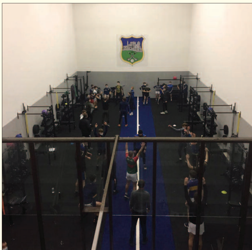
The New Tipperary GAA Setanta Academy in the former Thurles Handball Alley at Semple Stadium