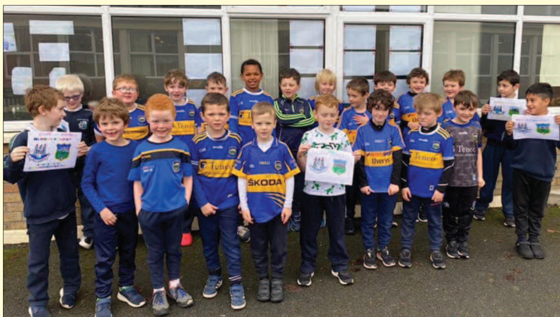
Primary school children wearing the jersey.