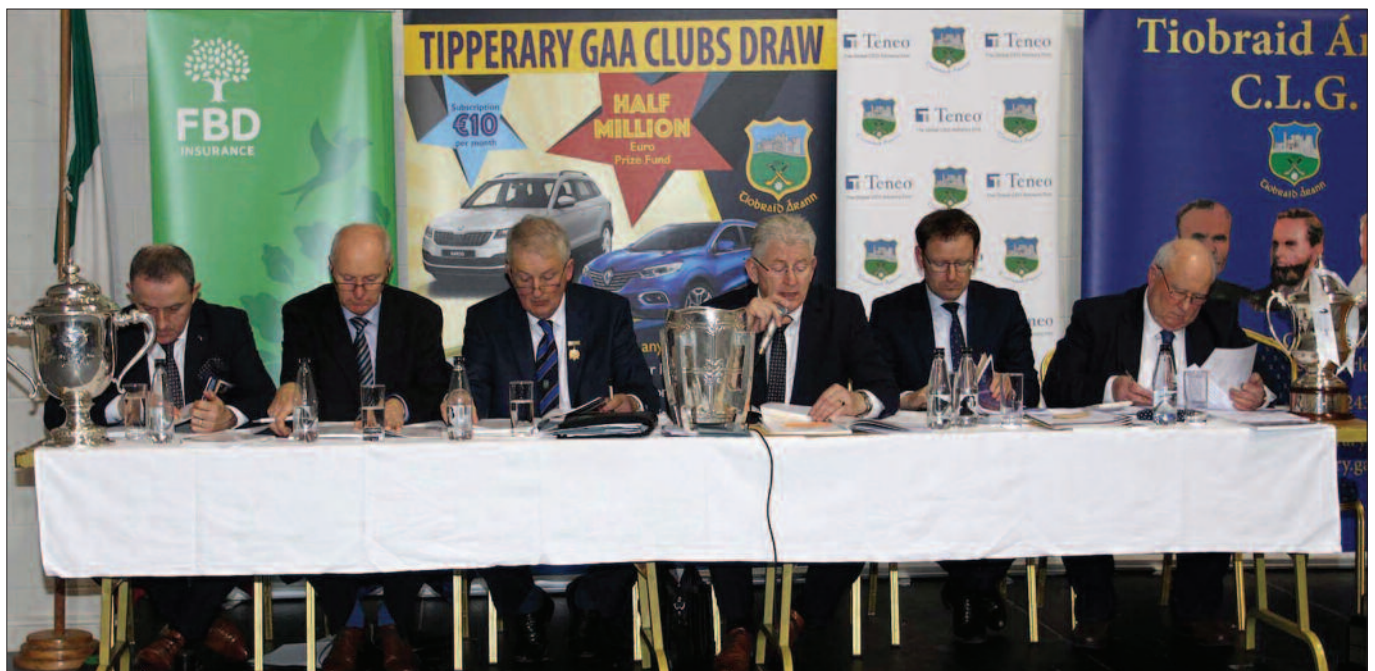
Tipperary County Board officers at 2019 convention.