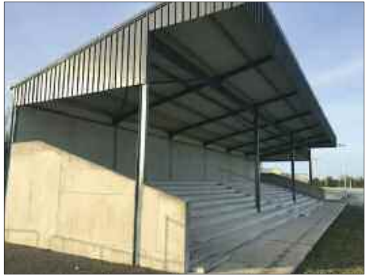
New spectator stand constructed at St. Cronan's Park Roscrea Hurling Club.