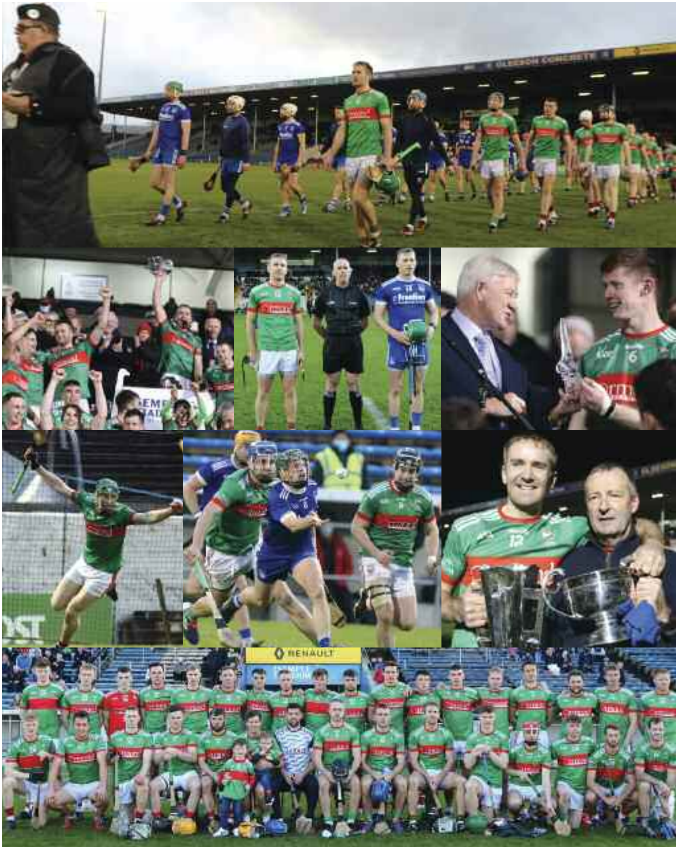
Loughmore/Castleiney panel that drew with Thurles Sarsfields in the FBD Insurance County SHC and won the replay.