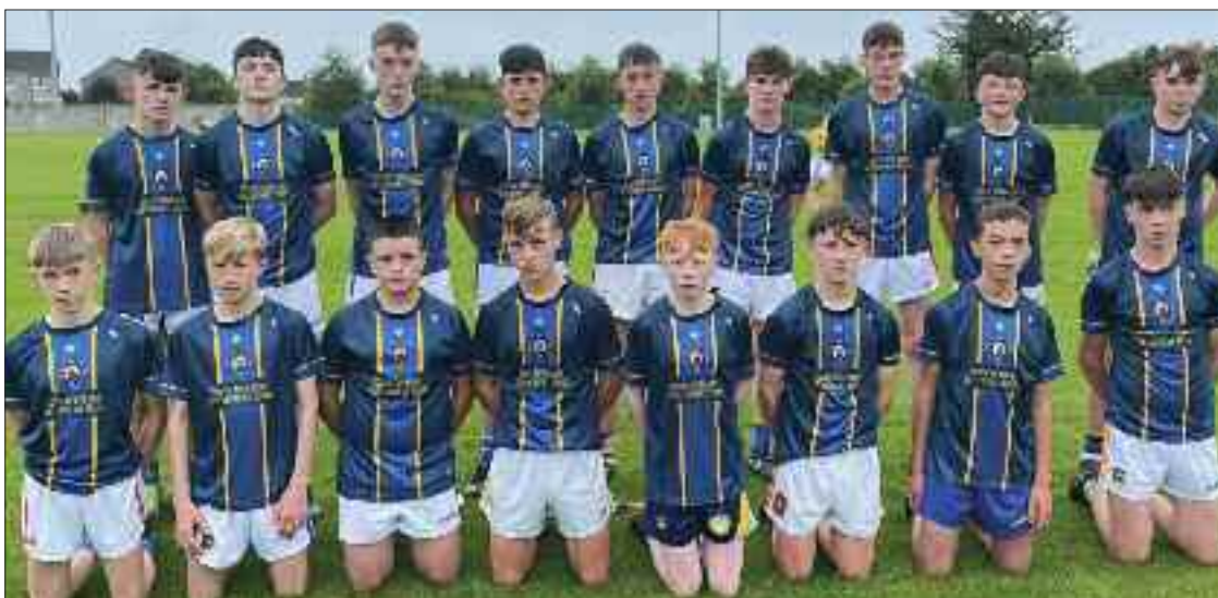
South Tipperary U14 Hurling Team