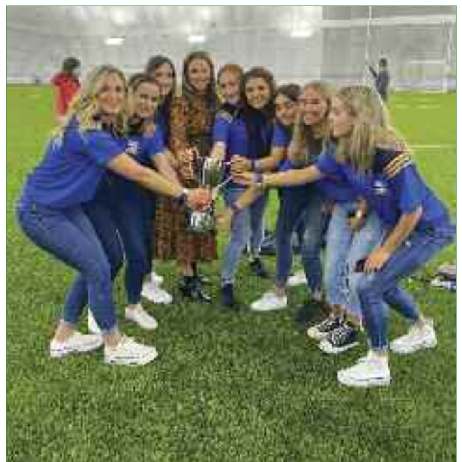
The Newcastle Figure Dancers celebrate at the Connacht Airdome in Mayo following their 2020 All Ireland title victory on Sat 20th Nov 2021