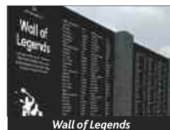
Wall of Legends