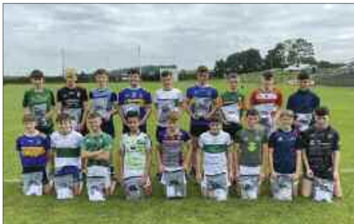
North Tipperary Hurling U14 panel

Huge thank you to all the mentors that got involved this year. The players that came in got excellent sessions with the coaches. I would like to thank the secretaries of each club for getting messages out about trials for me and to the clubs that allowed the use of their facilities. We have had divisional squads running two to three times a week from May to the first week of December this year which took a huge commitment from coaches, players and parents. This year we got gear of Gaelic Armour in Nenagh for all squads, I would like to take this opportunity to