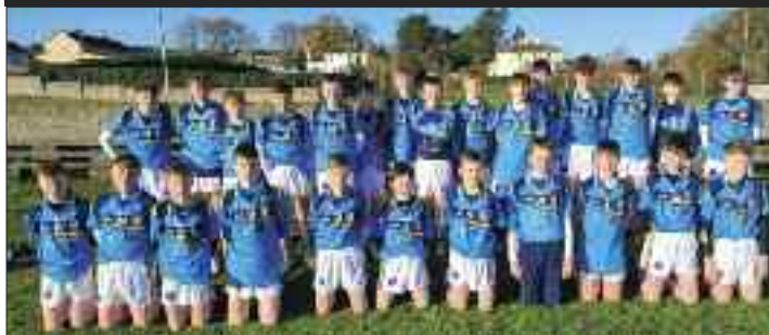
North Tipperary U13 Peadar Cummins panel