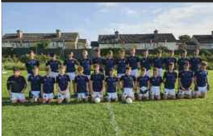
North Tipperary football U14 panel