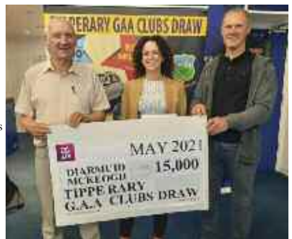
North Tipp Winner: Ballina GAAClub Chairman won 1st Prize in May 2021