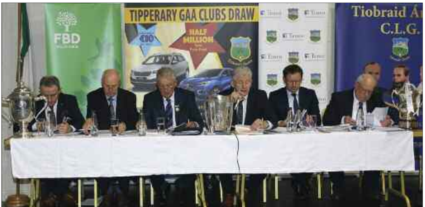
Tipperary County Board officers at 2019 convention.