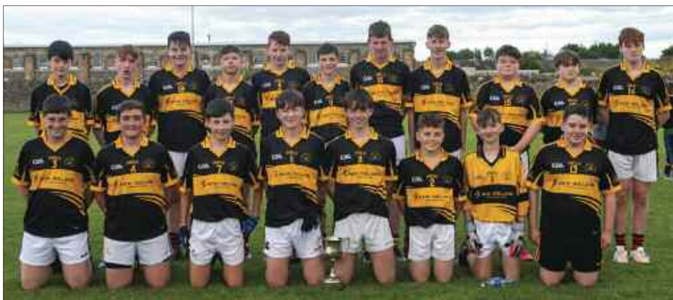
Moneygall/Clonakenny U15B County Football Champions 2021