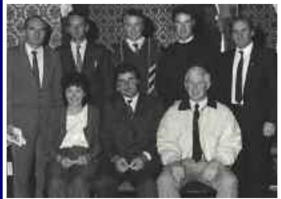
Féile na nGael organising committee 1991 to celebrate 20 years of Féile na nGael