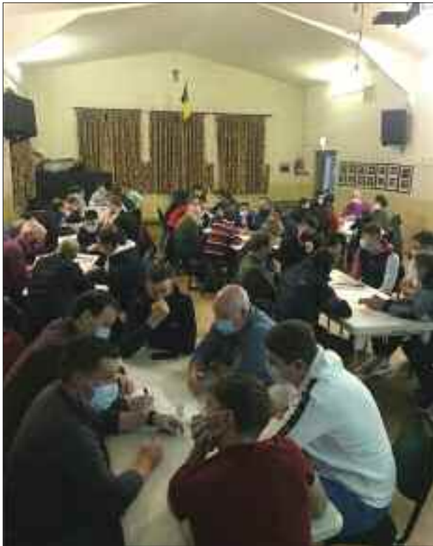
Members of Rosegreen GAA club busy devising their new Strategic Club Plan recently.