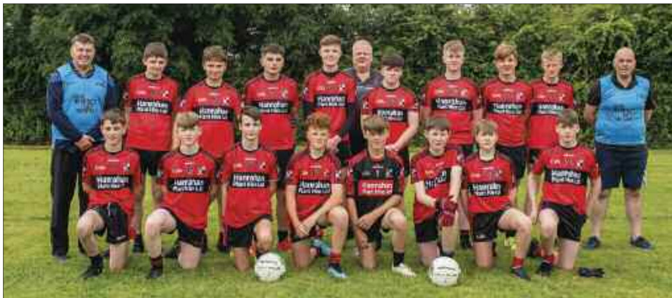
Ballyporeen U15C County Football Champions 2021