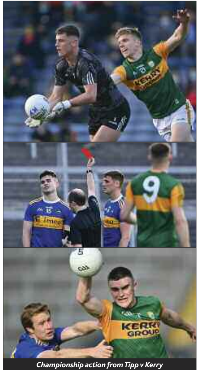
Championship action from Tipp v Kerry