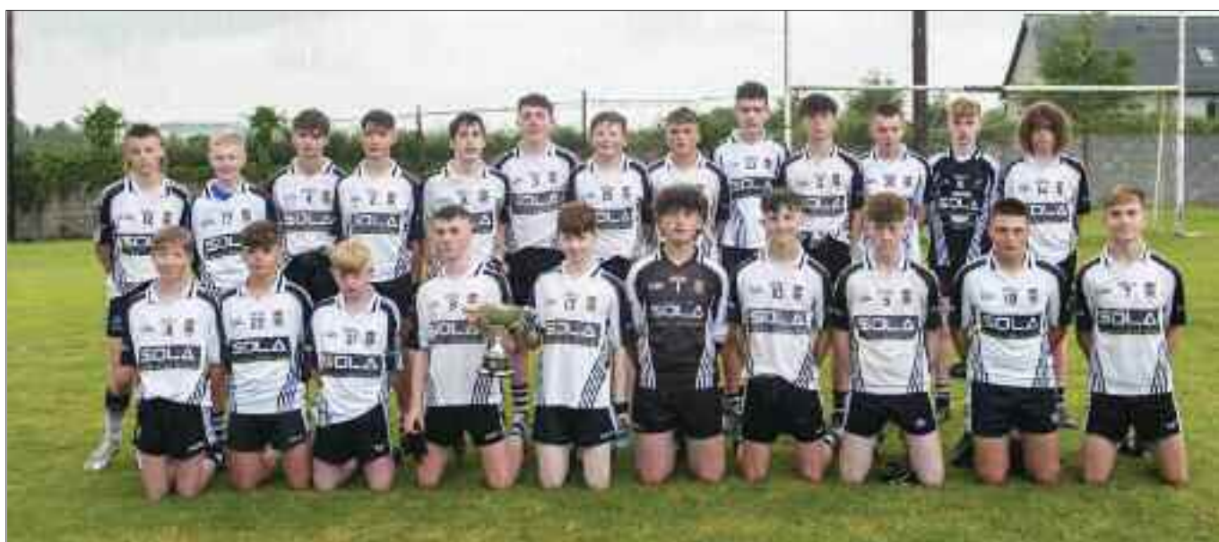
JK Brackens County U15A Football Champions 2021