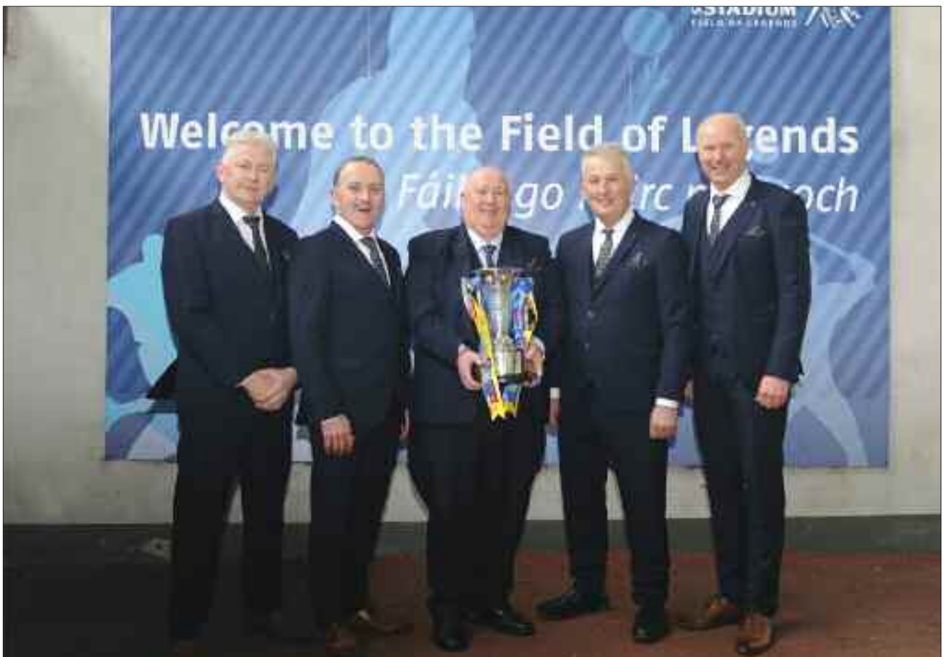
Tipperary GAA Board officers 2020