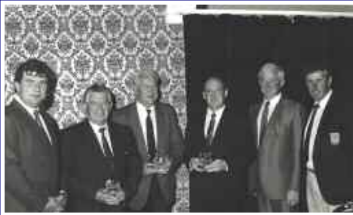
Presentation to the founding members in 1971.