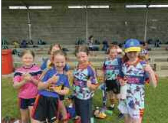
Cul Camp in Mid Tipp