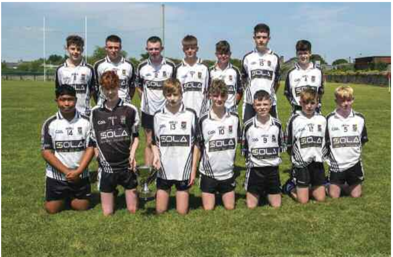
JK Brackens - County U15D Football champions 2021

We wish you all a very Happy Christmas and the best of everything in 2022.