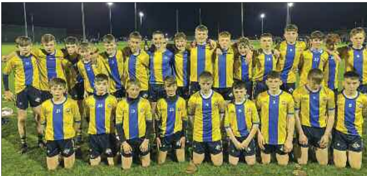
South Tipperary: Peadar Cummins Cup Winners 2021