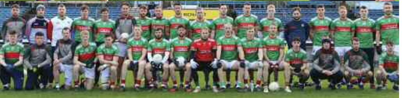
Loughmore/Castleiney - FBD Insurance County Senior Football champions.