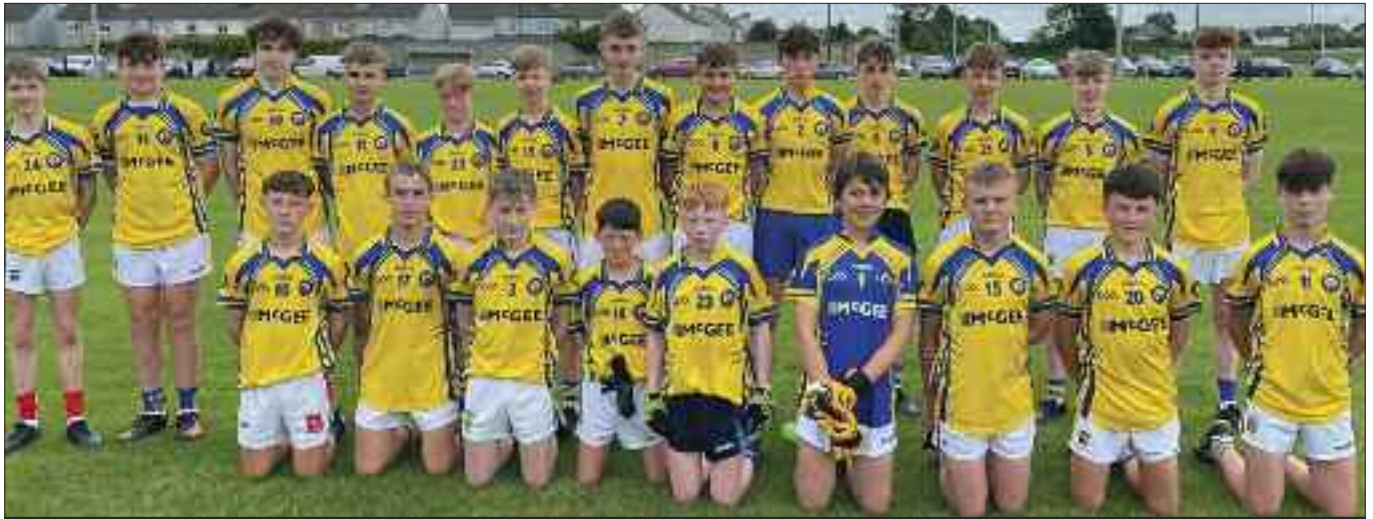
South Tipperary U14 football team