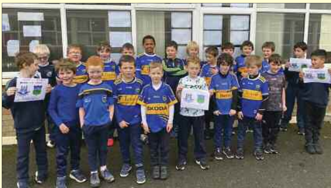
Primary school children wearing the jersey.