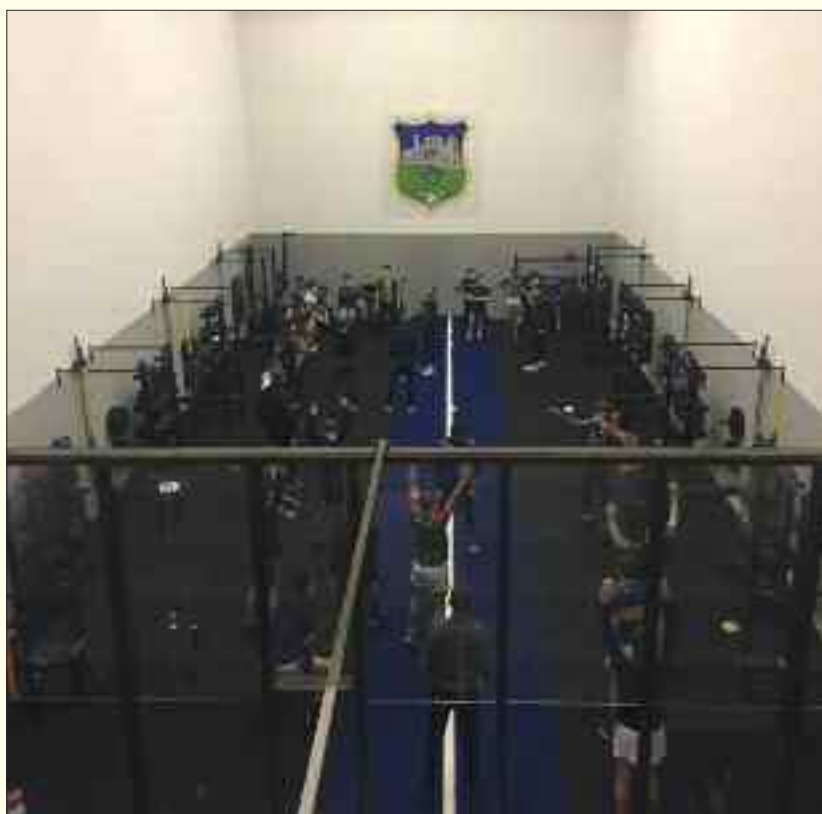
The New Tipperary GAA Setanta Academy in the former Thurles Handball Alley at Semple Stadium