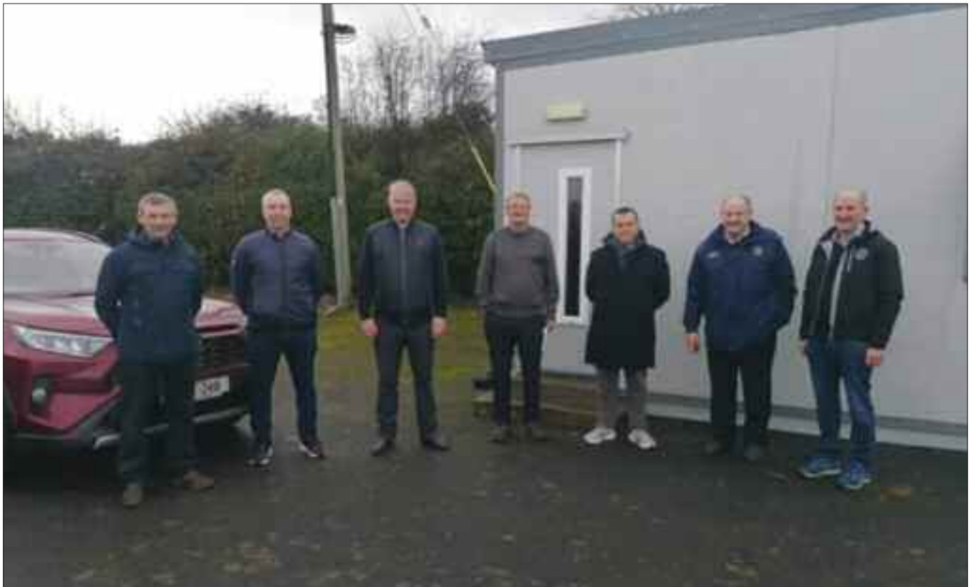
Tipperary Hearings Committee 2021