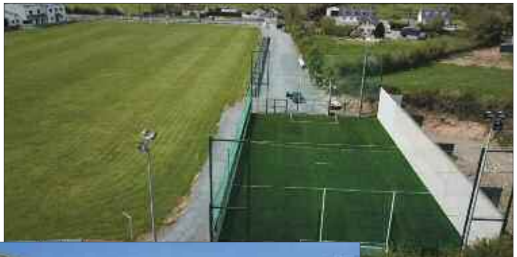
Upperchurch Hurling Wall