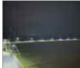
Lattin Cullen GAA Club recently completed a top class fully floodlit walking track at their grounds. The project was overseen by a very hard-working committee who put in a lot of work to ensure that the finished product would be something that the club and community in general can be proud of.