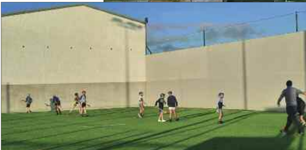
New astro turf and hurling wall underway at Nenagh Eire Óg GAA club